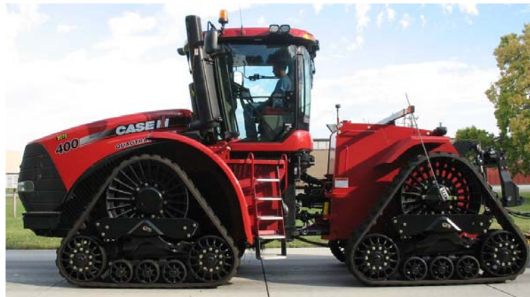
CASE IH Steiger Rowtrac 400 Diesel

Institute of Agriculture and Natural Resources University of Nebraska-Lincoln