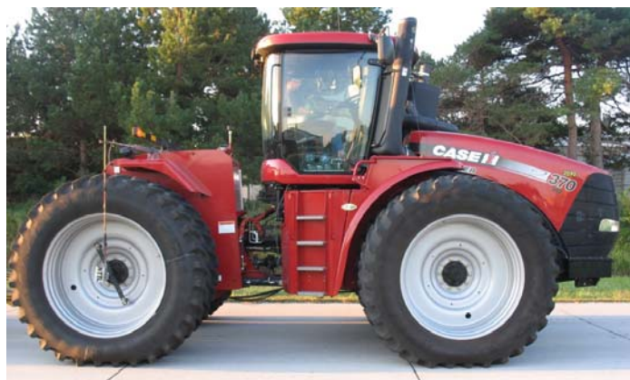
CASE IH STEIGER 370 Diesel

Institute of Agriculture and Natural Resources University of Nebraska-Lincoln