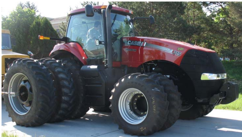
CASE IH MAGNUM 315 DIESEL