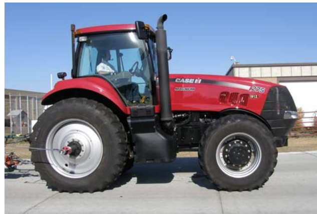
CASE IH MAGNUM 275 DIESEL