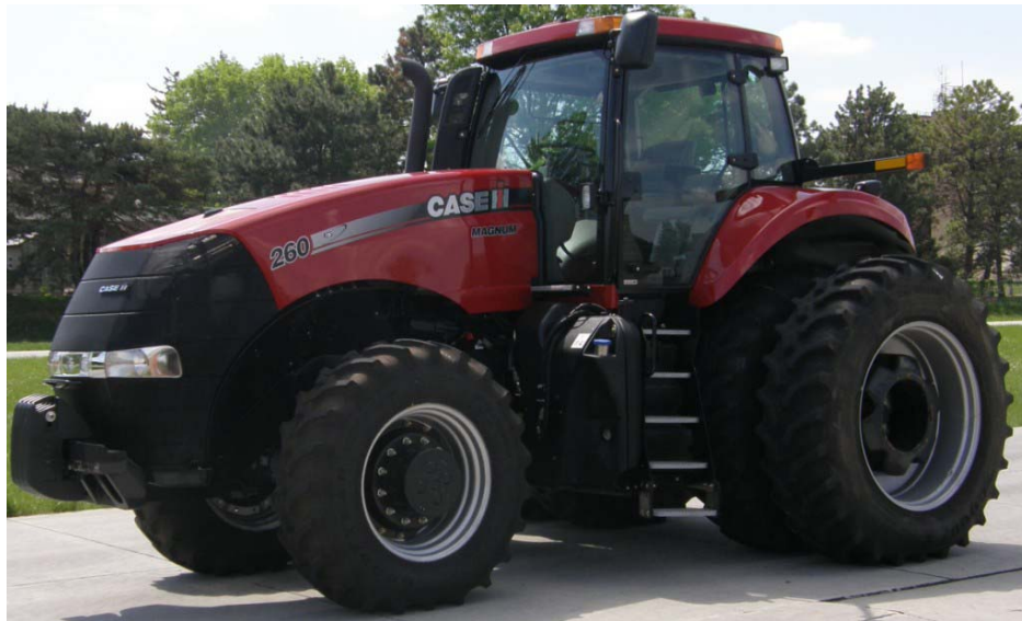
CASE IH MAGNUM 260 DIESEL