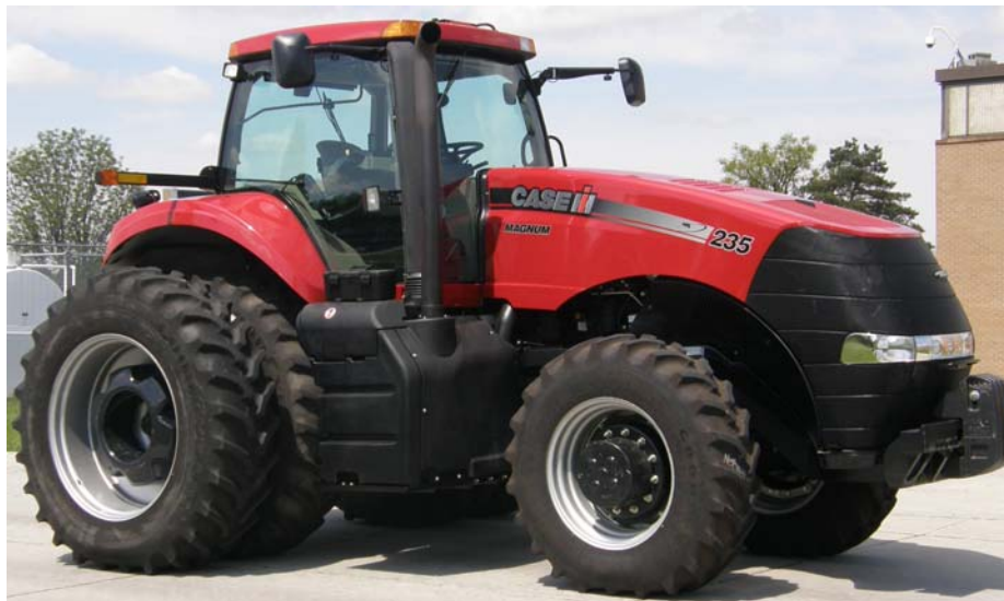
CASE IH MAGNUM 235 DIESEL