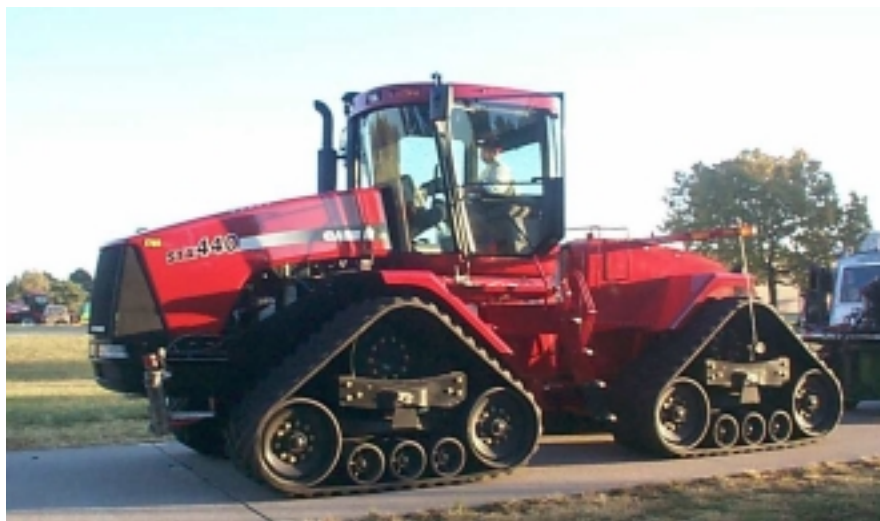
Case IH STX 440 Quadtrac Diesel