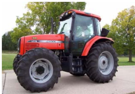
AGCO LT 75 Diesel

REPAIRS AND ADJUSTMENTS: No repairs or adjustments