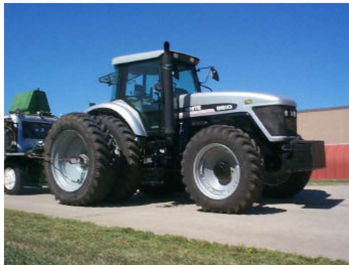
White 8610 Diesel