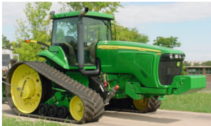
JOHN DEERE 8520T DIESEL