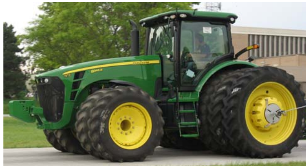
JOHN DEERE 8345R DIESEL