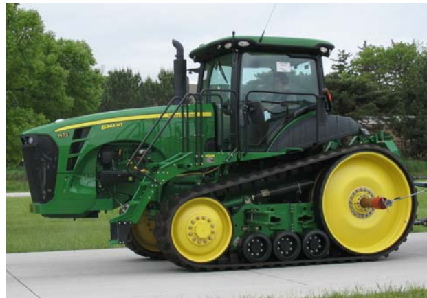
JOHN DEERE 8345RT DIESEL