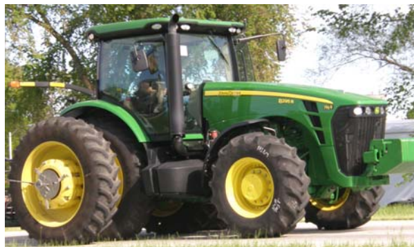
JOHN DEERE 8295R DIESEL