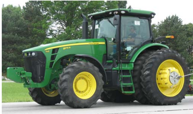
JOHN DEERE 8270R DIESEL