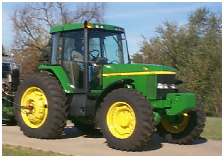
JOHN DEERE 7510 DIESEL