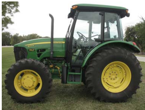
JOHN DEERE 5105M DIESEL