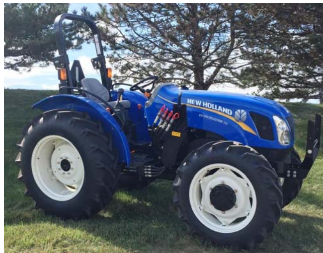
New Holland Workmaster 70 Diesel (FWA model pictured was not tested)

NTTL.(2019). Nebraska Tractor test 2209A for New Holland Workmaster 70 Diesel. Lincoln, NE:Nebraska Tractor Test Laboratory. Retrieved from http://tractortestlab.unl.edu