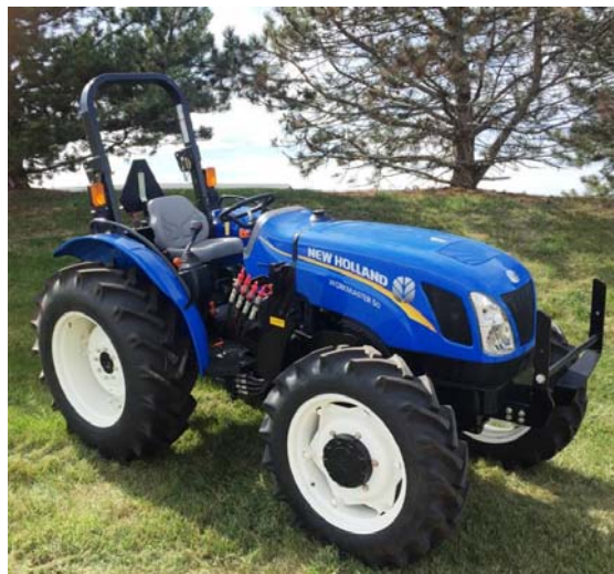
New Holland Workmaster 50 Diesel Institute of Agriculture and Natural Resources University of Nebraska–Lincoln

Lincoln, NE:Nebraska Tractor Test Laboratory. Retrieved from http://tractortestlab.unl.edu