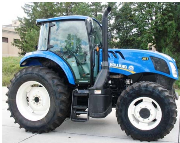
NEW HOLLAND TS6.120 DIESEL

Institute of Agriculture and Natural Resources University of Nebraska-Lincoln