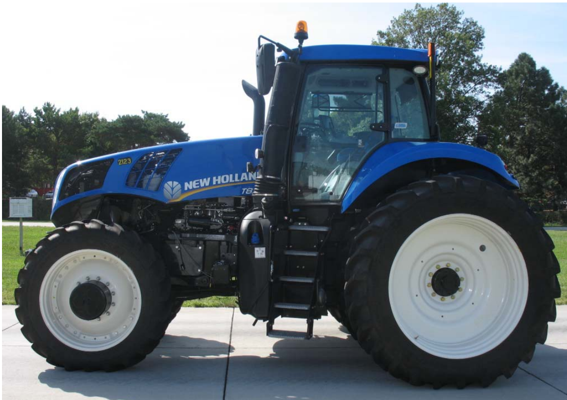
NEW HOLLAND T8.350 DIESEL