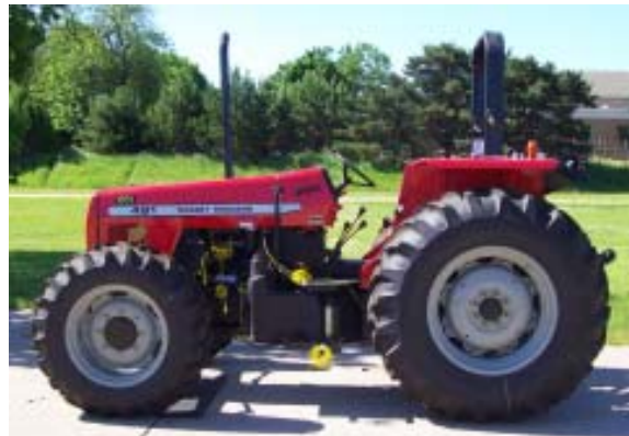
MASSEY FERGUSON 491 Diesel

REPAIRS AND ADJUSTMENTS: No repairs or adjustments.