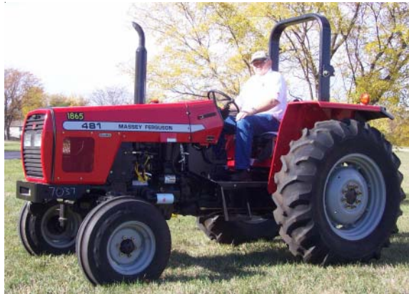
MASSEY FERGUSON 481 Diesel

Institute of Agriculture and Natural Resources University of Nebraska-Lincoln