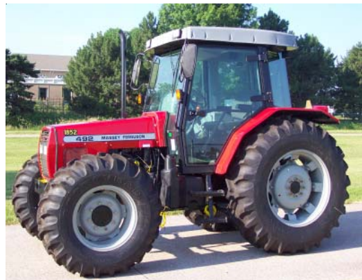
MASSEY FERGUSON 492 Diesel