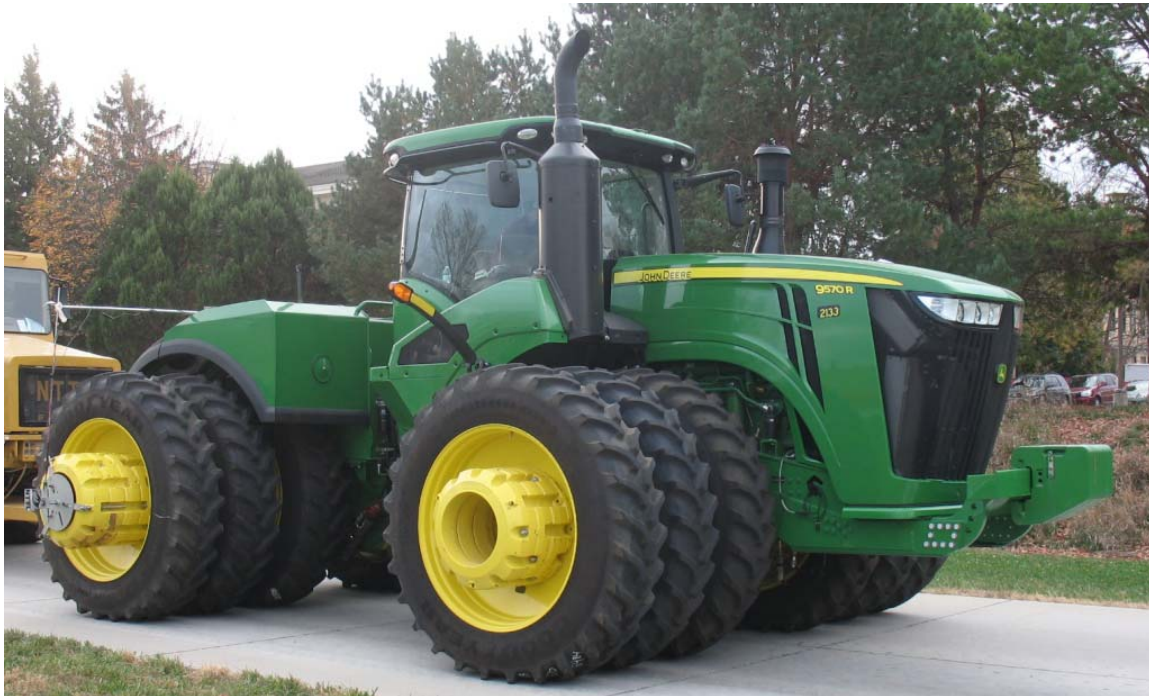
JOHN DEERE 9570R DIESEL