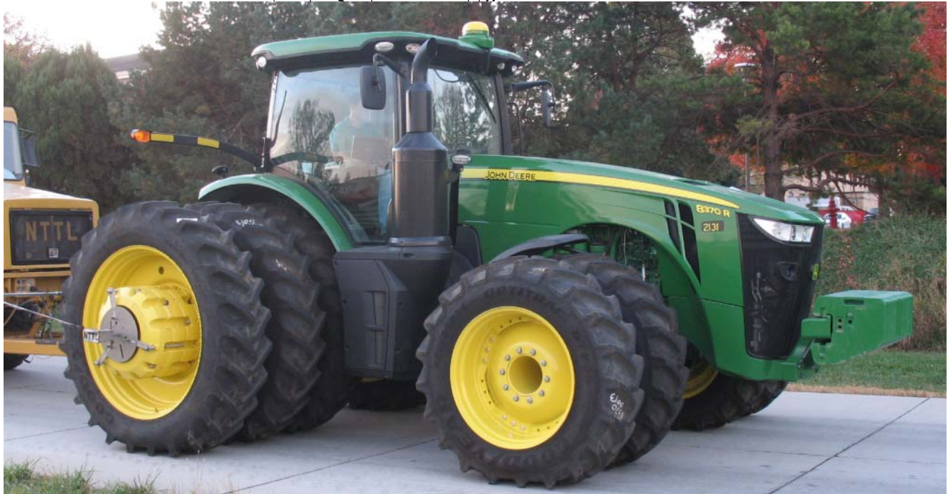
JOHN DEERE 8370R DIESEL