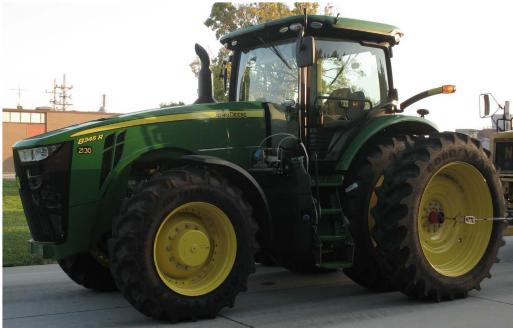
JOHN DEERE 8345R DIESEL Institute of Agriculture and Natural Resources University of Nebraska—Lincoln