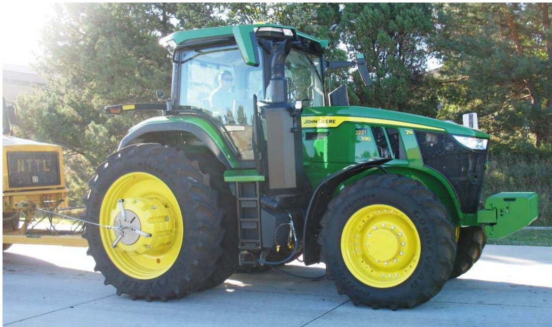
JOHN DEERE 7R 330 DIESEL

NTTL.(2021). Nebraska OECD tractor test 2221 for John Deere 7R 330 e23 Diesel. Lincoln, NE:Nebraska Tractor Test Laboratory. Retrieved from http://tractortestlab.unl.edu