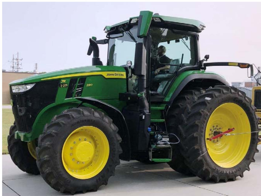
JOHN DEERE 7R 290 DIESEL

NTTL.(2021). Nebraska OECD tractor test 2219 for John Deere 7R 290 e23 Diesel. Lincoln, NE:Nebraska Tractor Test Laboratory. Retrieved from http://tractortestlab.unl.edu