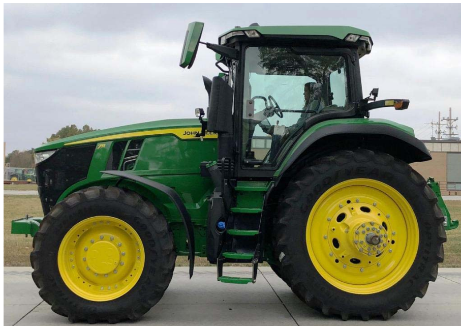
JOHN DEERE 7R 230 e23 DIESEL Institute of Agriculture and Natural Resources University of Nebraska–Lincoln

NTTL.(2021). Nebraska OECD tractor test 2090A for John Deere 7R 230 e23 Diesel. Lincoln, NE:Nebraska Tractor Test Laboratory. Retrieved from http://tractortestlab.unl.edu