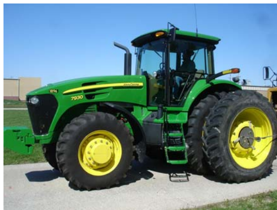
JOHN DEERE 7930 PS DIESEL