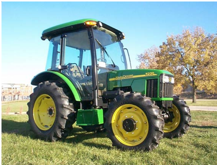
John Deere 5220 Diesel