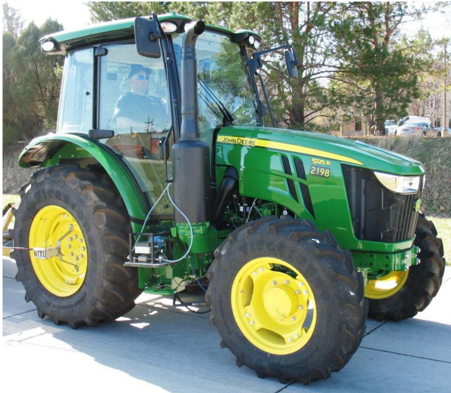
JOHN DEERE 5125R DIESEL

NTTL.(2018). Nebraska OECD tractor test 2198 for John Deere 5125R PFC Diesel. Lincoln, NE:Nebraska Tractor Test Laboratory. Retrieved from http://tractortestlab.unl.edu