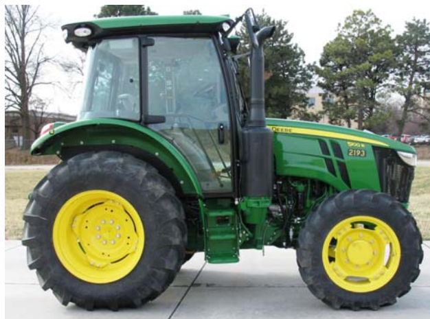
JOHN DEERE 5100R DIESEL

Institute of Agriculture and Natural Resources University of Nebraska–Lincoln