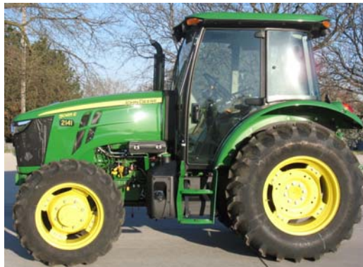
John Deere 5085E Diesel Institute of Agriculture and Natural Resources University of Nebraska-Lincoln