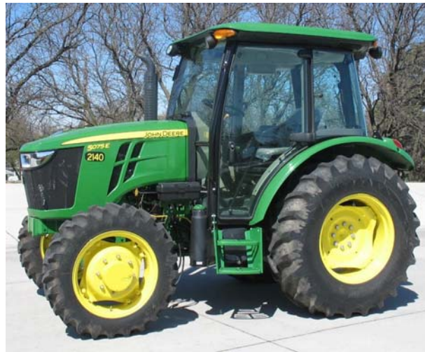
John Deere 5075E Diesel