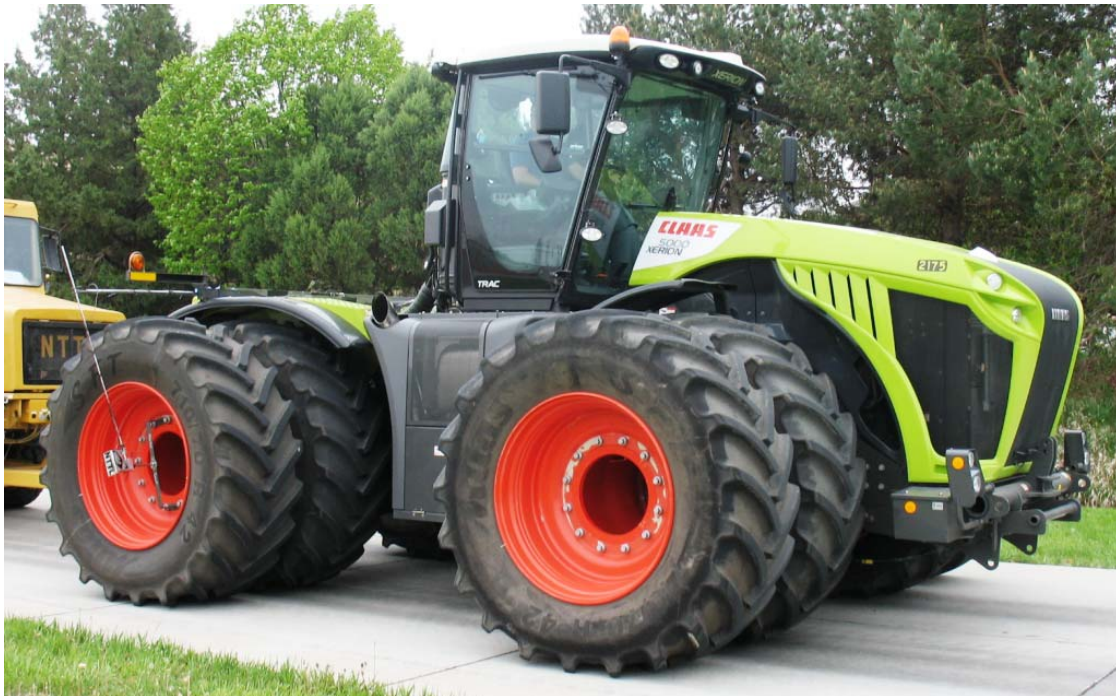
CLAAS XERION 5000 Diesel

Institute of Agriculture and Natural Resources University of Nebraska-Lincoln