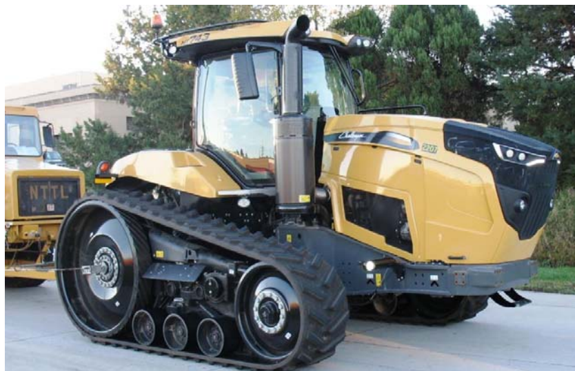
CHALLENGER MT743 DIESEL Institute of Agriculture and Natural Resources University of Nebraska–Lincoln

NTTL.(2018). Nebraska OECD Tractor test 2207 for Challenger MT743 Diesel. Lincoln, NE:Nebraska Tractor Test Laboratory. Retrieved from http://tractortestlab.unl.edu