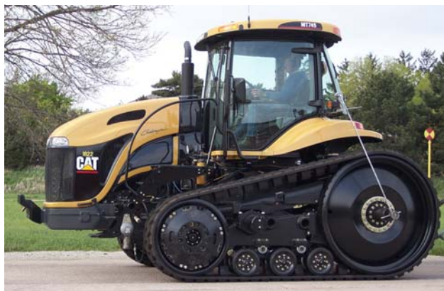
CHALLENGER MT745 DIESEL