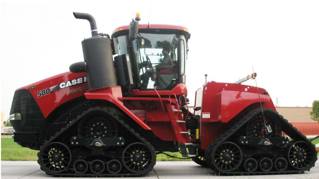
Case IH Steiger 580 Quadtrac Diesel