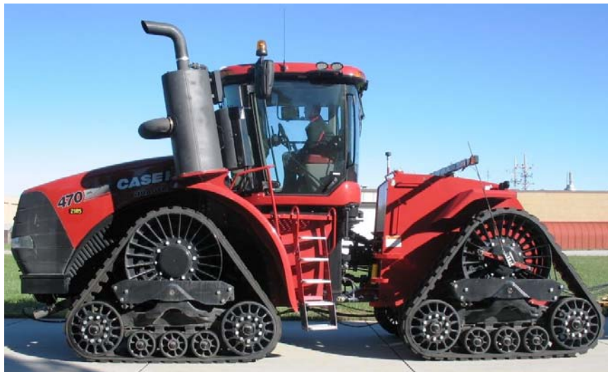
CASE IH 470 ROWTRAC Diesel

NTTL.(2017). Nebraska OECD tractor test 2185 for Case IH Steiger 470 Rowtrac Diesel. Lincoln, NE:Nebraska Tractor Test Laboratory. Retrieved from http://tractortestlab.unl.edu