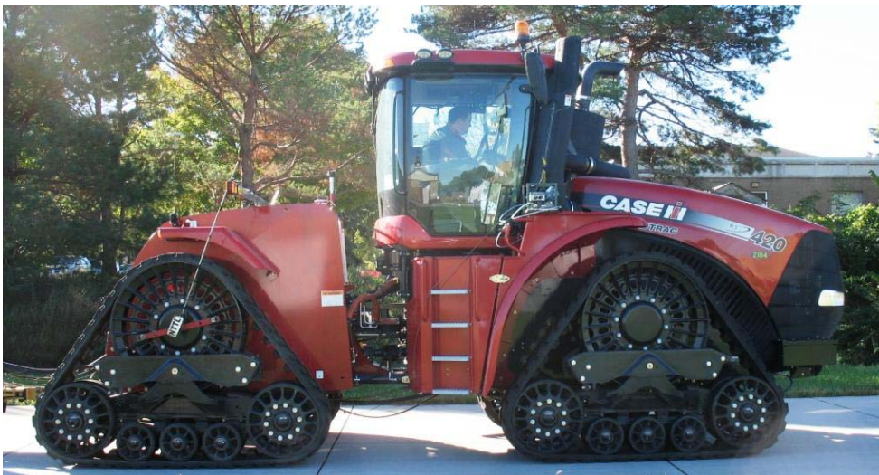
CASE IH 420 ROWTRAC Diesel

NTTL.(2017). Nebraska OECD tractor test 2184 for Case IH Steiger 420 Rowtrac Diesel. Lincoln, NE:Nebraska Tractor Test Laboratory. Retrieved from http://tractortestlab.unl.edu