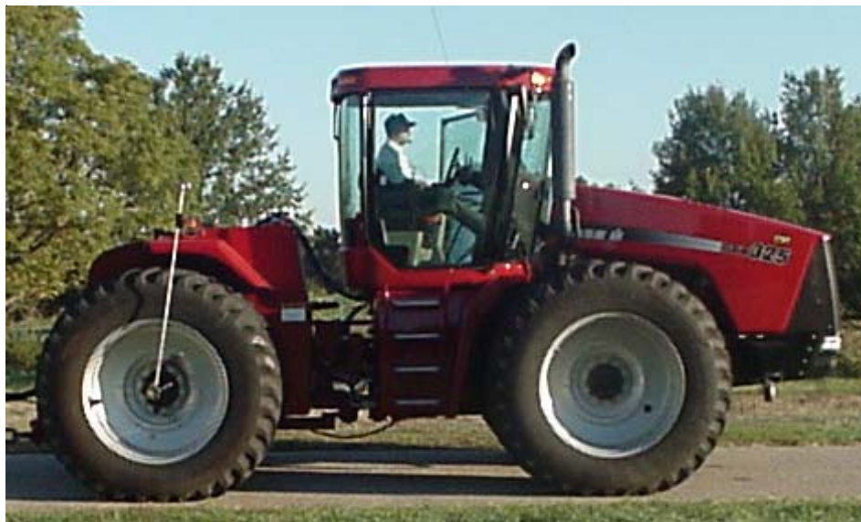
Case IH STX 325 Diesel