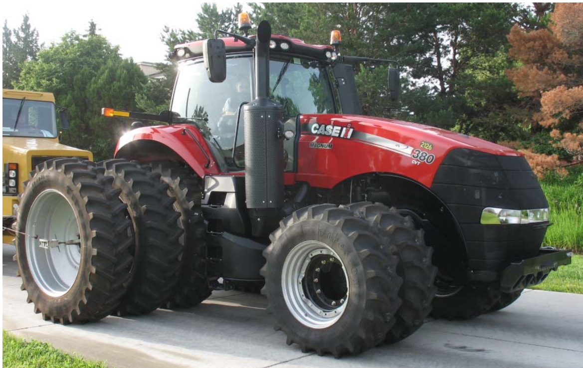
CASE IH MAGNUM 380 DIESEL