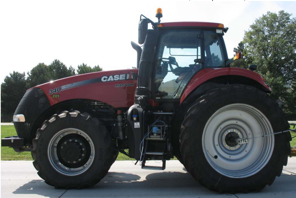
CASE IH MAGNUM 340 DIESEL