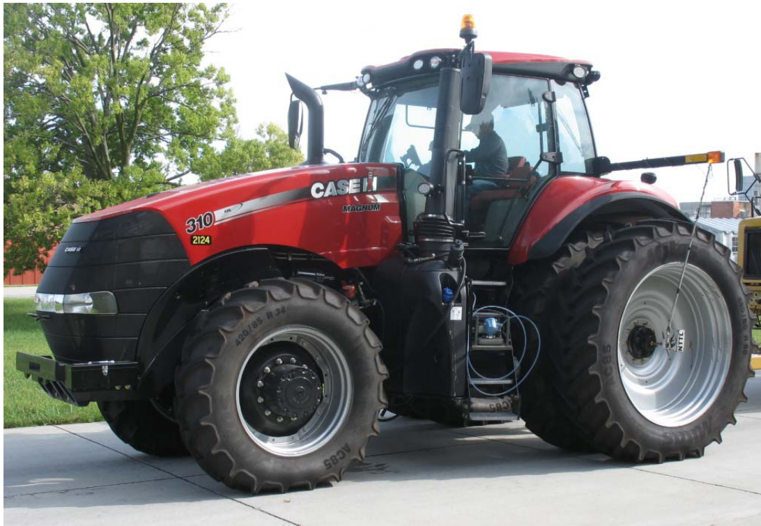
CASE IH MAGNUM 310 DIESEL