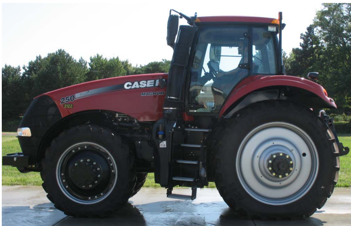
CASE IH MAGNUM 250 DIESEL