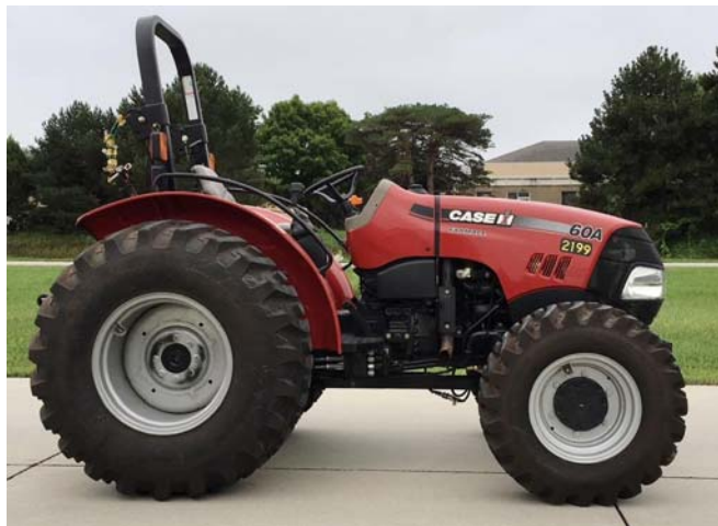
Case IH Farmall 60A Diesel

Lincoln, NE:Nebraska Tractor Test Laboratory. Retrieved from http://tractortestlab.unl.edu