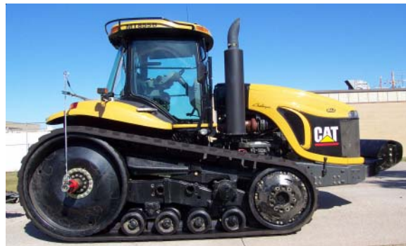
CHALLENGER MT855B DIESEL