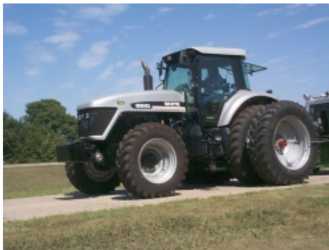
White 8510 Diesel