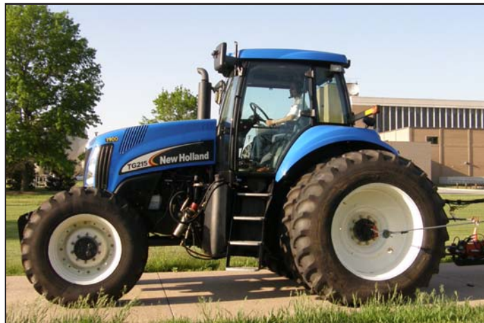
NEW HOLLAND TG215 DIESEL